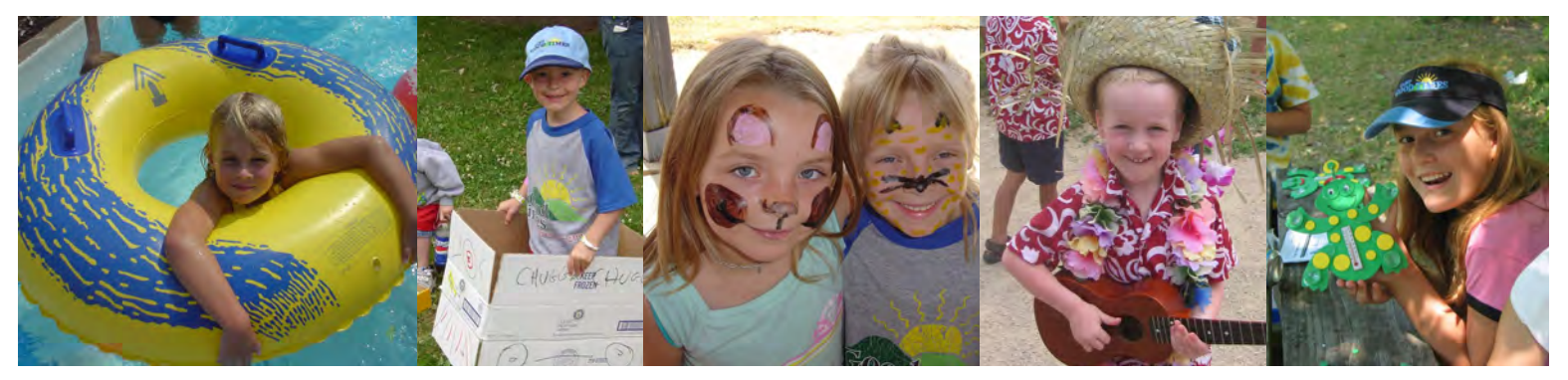
Go online at www.goodtimesdaycamp.com to see the 2024 Calendar